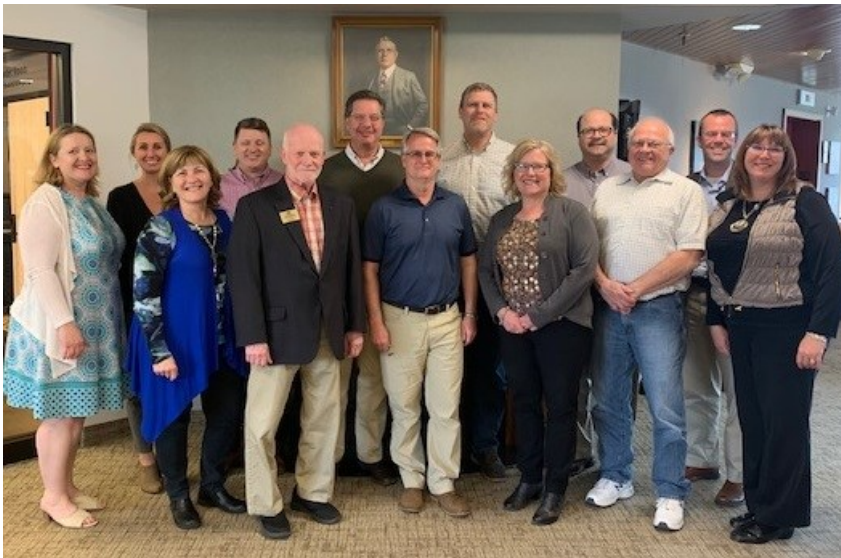
IEDC staff and board members at strategic planning session

We received a draft of the plan in June and will be providing a full report in August. I am excited to share the results!