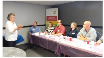
Judging panel at Food Sensory Event