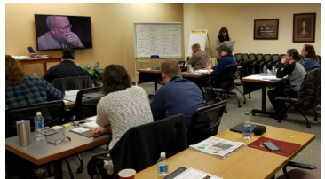
Grand Rapids Profit Mastery